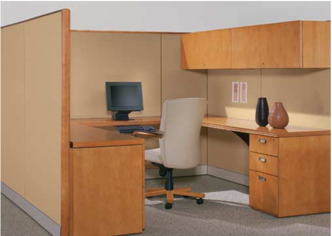
Cetra's transitional top and end trim profiles unify the style of the panels and Footprint components in this 8' X 8' space.

The system's acoustical, sectional and stackable panels tailor the space, providing a rigid structural foundation and housing all the power and communications you need. Cetra addresses every workplace application and handsomely outfits each floor plan.