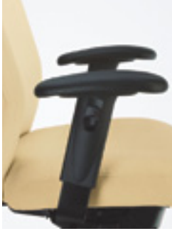
Height and width adjustable arm