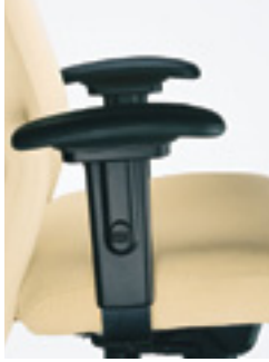
Fully adjustable arm