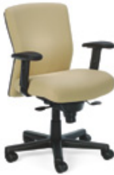
Synchro-tilt Mid-back Height Adjustable Arms Seat Slider