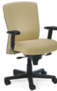
Synchro-tilt High Back Height and Width Adjustable Arms Seat Slider