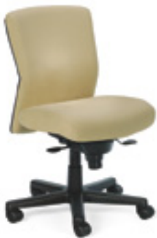
Synchro-tilt Mid-back Seat Slider Armless