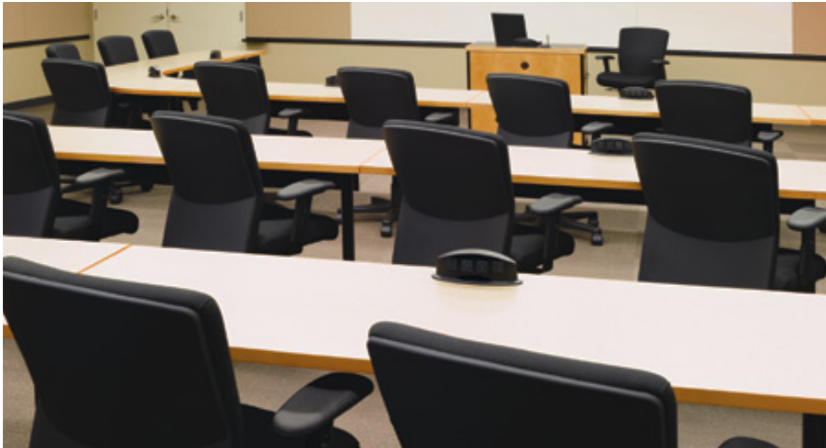
Product specifications: (Top left) Xtreme K31CE, Shenanigans 20300 Gimmick; (Top right) Xtreme K31BE, Pollack Suede Charade 9908-01 Raw Silk and 9908-02 Sisal, Cetra System with Footprint worksurfaces and storage; (Bottom) Xtreme K31MR, Spectrum 20020 Black; Configuration tables.