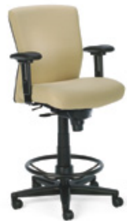
Synchro-tilt Mid-back Stool Fully Adjustable Arms

For the entire statement of line, please refer to the Kimball Office Seating Price List.